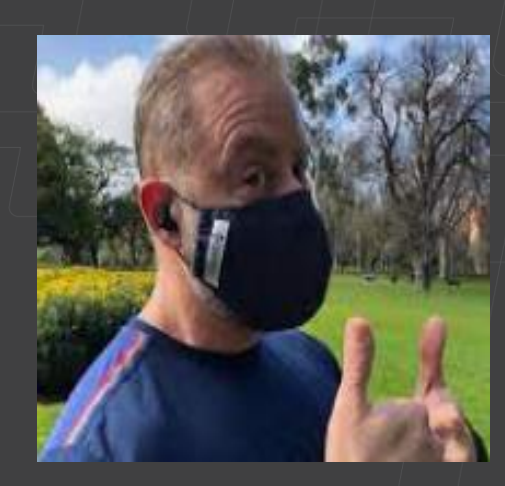
Gloves for cleaning & face masks as required.