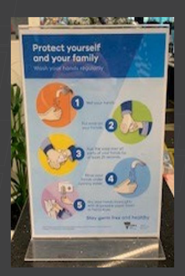
COVID related signage