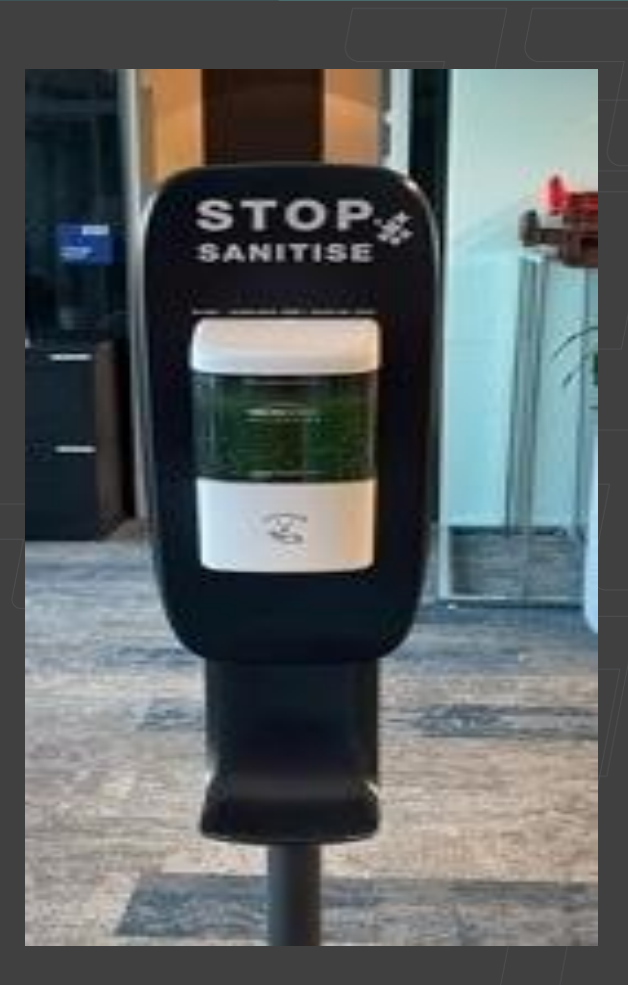
Hand Sanitising Station