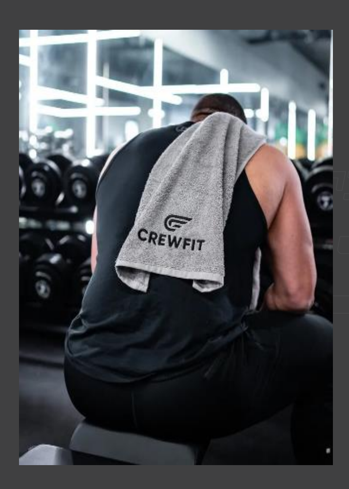
No towel, no workout.