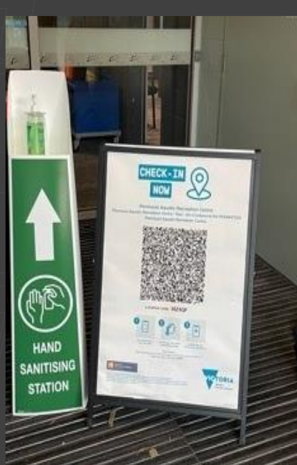
Hand sanitising station