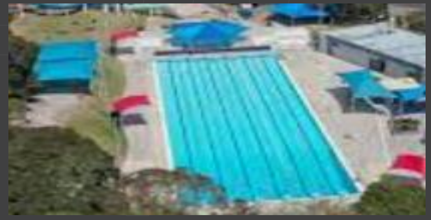
Returning to what we love doing!